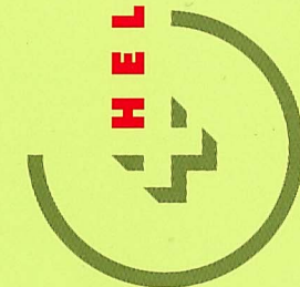
Official Swiss commemorative coins