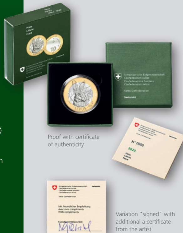
Proof with certificate of authenticity

*Sales per household are limited to one piece.