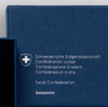
Proof with certificate of authenticity