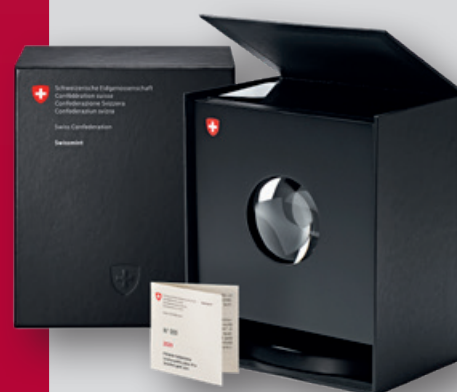
Special minting with certificate of authenticity

Issue date: 23 January 2020 Sales period: until 22 January 2023 or while stocks last