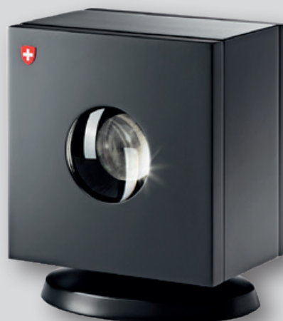
→ Presentation case