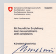
Variation "signed" with additional a certificate from the artist