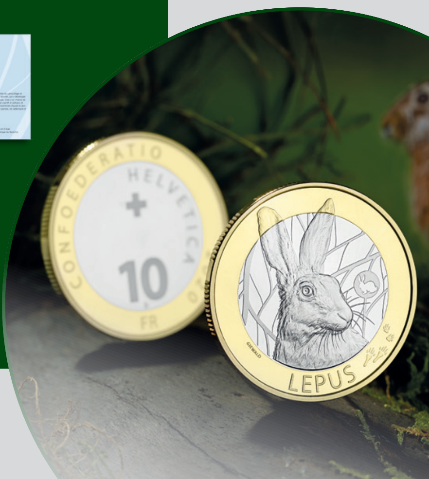
Variation "signed" with additional a certificate from the artist