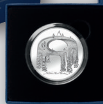
Proof with certificate of authenticity