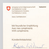
Variation "signed" with additional a certificate from the artist