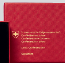
Proof with certificate of authenticity