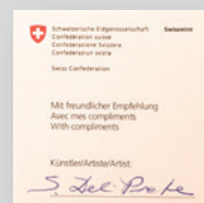
Variation "signed" with additional a certificate from the artist