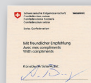
Variation "signed" with additional a certificate from the artist