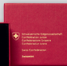
Proof with certificate of authenticity