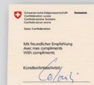
Variation "signed" with additional a certificate from the artist