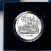
Proof with certificate of authenticity