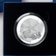
Proof with certificate of authenticity