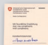
Variation "signed" with additional a certificate from the artist